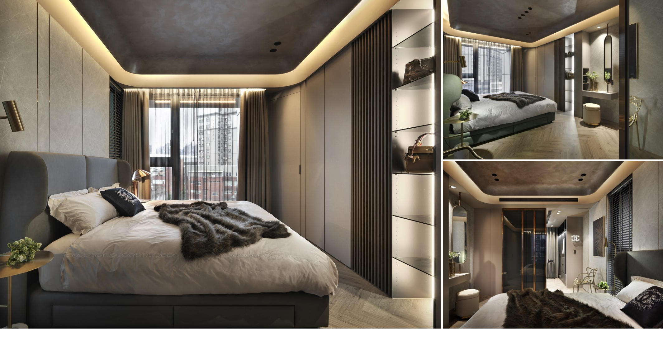
the layout retains only the master and guest bedrooms,